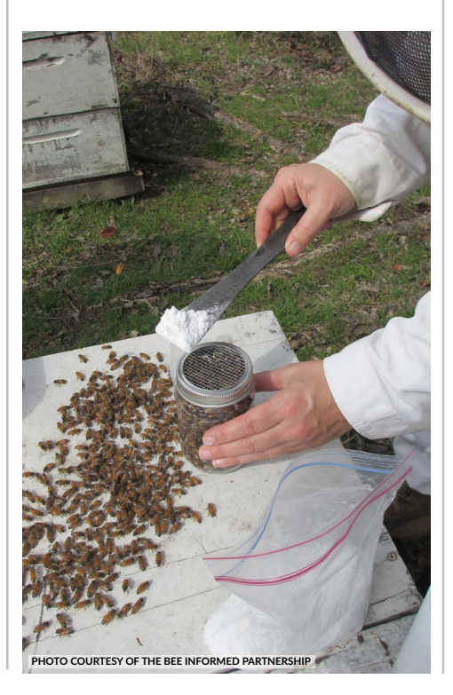
Tools for Varroa Management | Page 6

See the References and Additional Resources section for journal articles on sampling methods.