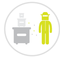
Outreach, Education & Communications