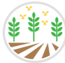
Crop Pest Management