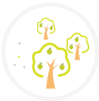
Forage & Nutrition

The Coalition is focusing on accelerating collective impact to improve honey bee health in four key areas.