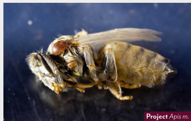
Honey bee with T. mercedesae , and V. destructor .

The life cycle of Tropilaelaps mites is similar to that of Varroa mites; they reproduce in capped brood cells in the colony, and feed primarily on the hemolymph of honey bee brood. Both mites vector viruses, such as deformed wing virus (DWV). While Varroa mites can feed on adult bees, it is believed the mouthparts of Tropilaelaps cannot penetrate the exoskeleton of an adult bee. As a result, Tropilaelaps mites cannot survive on adult bees for more than 2–3 days and require constant access to brood to feed and reproduce.